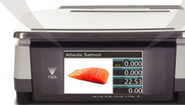
7" WVGA Customer Display